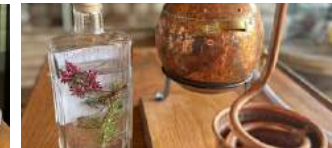
Gordon Castle Gin School All year round