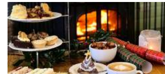
Christmas Afternoon Tea & seasonal Afternoon Tea All year round