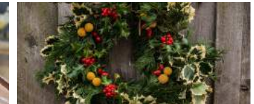
Wreath Making Workshop Other seasonal workshops all year round

Gordon Castle Walled Garden, Fochabers, Moray, Scotland, IV32 7PQ.