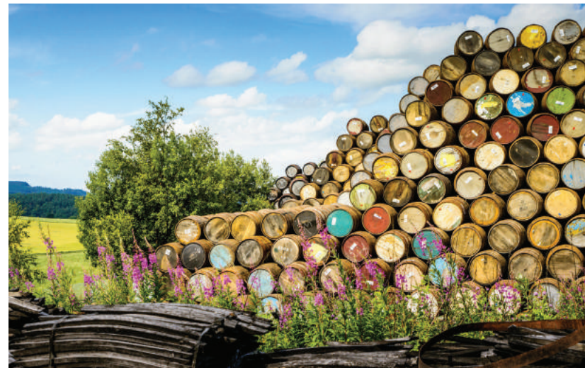
Clockwise from left: Johnstons of Elgin make fine cashmere and woollen goods; colourful whisky casks at the Speyside Cooperage; the dramatic ruins of Elgin cathedral; a Highland cow in Craigellachie